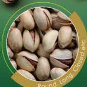
Round, Long, Closed etc